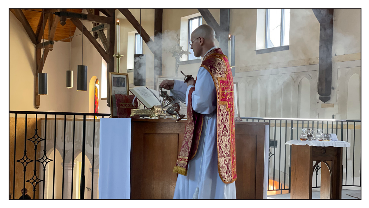
The 2021 Annual Mass at St Timothy's Episcopal Church (nave and sanctuary under construction)